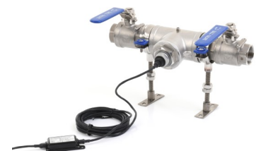
Optional In-flow adaptor