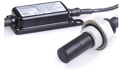
Sensor & electronics