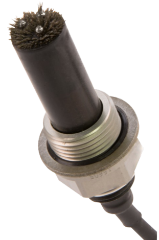
Sensor with debris attached