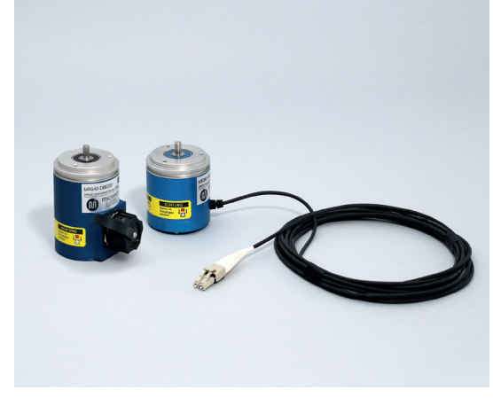
U.S. Patent 7,196,320 Inherently Safe, Simple Mechanical Device EPL Mb/Gb/Gc/Db/Dc